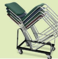
Model #DY86 Stacking Chair Dolly