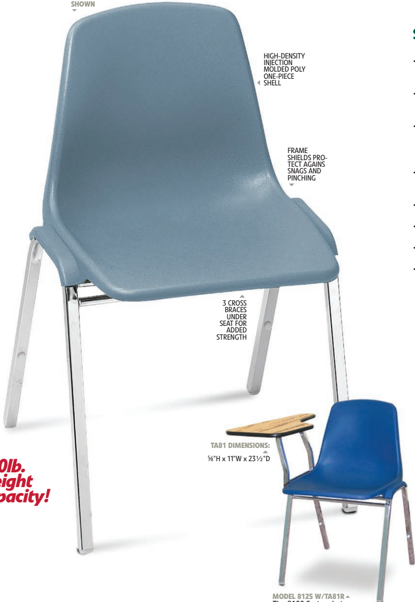
MODEL 8115 SHOWN

HIGH-DENSITY INJECTION MOLDED POLY ONE-PIECE SHELL