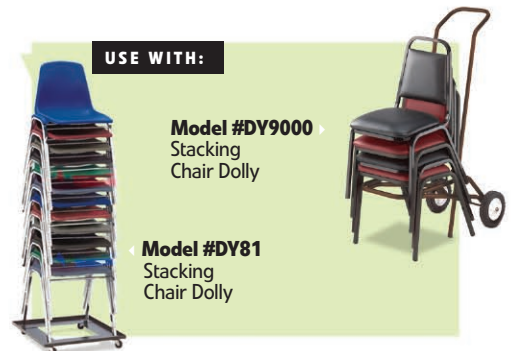
Model #DY9000 Stacking Chair Dolly