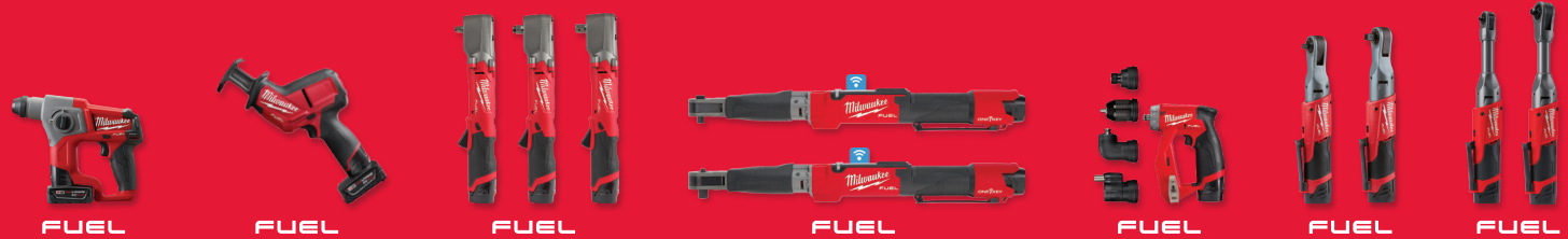
FUEL FUEL FUEL FUEL FUEL FUEL FUEL FUEL FUEL FUEL FUEL