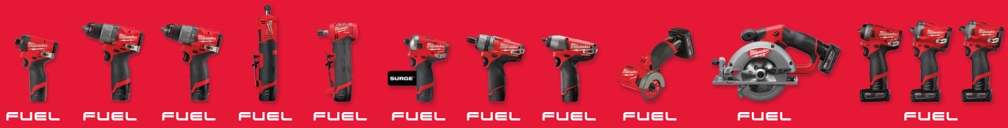
FUEL FUEL FUEL FUEL FUEL FUEL SURGE FUEL FUEL FUEL FUEL FUEL FUEL