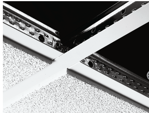
▲ Prelude XL suspension system

This hot-dipped galvanized steel 15/16" suspension system offers high recycled content for improved LEED® credits.