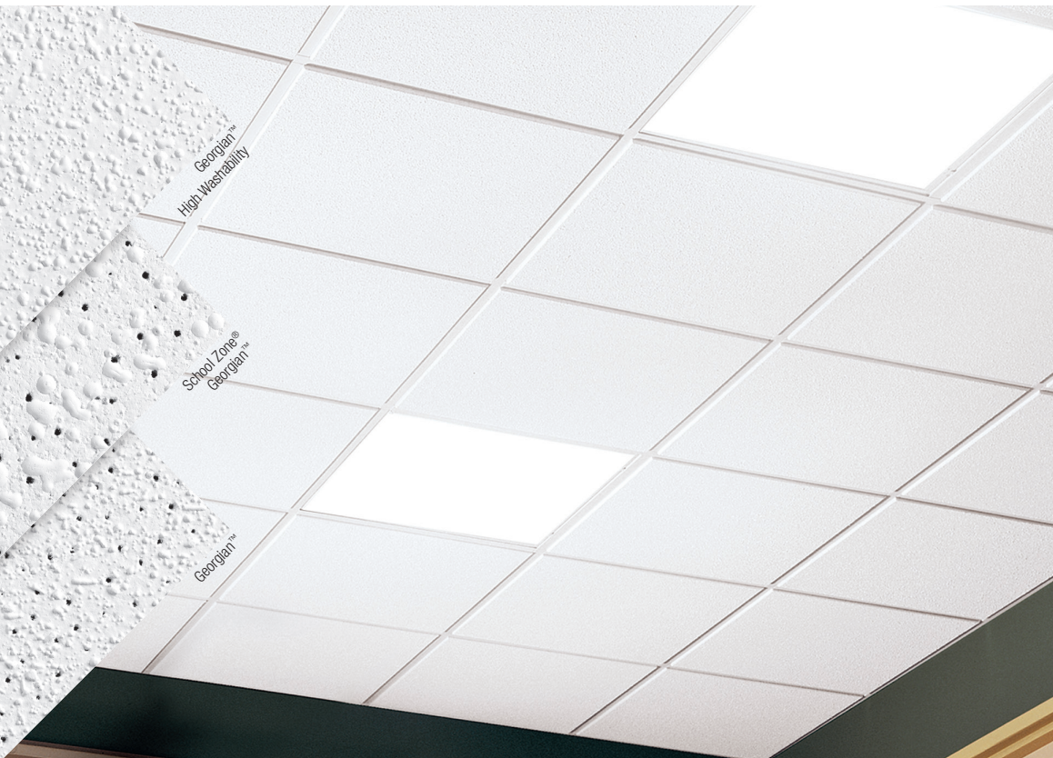
▲ Georgian™ Beveled Tegular panels with Prelude® XL® 15/16" suspension system

CAD/Revit® drawings at: armstrongceilings.com/cadrevit