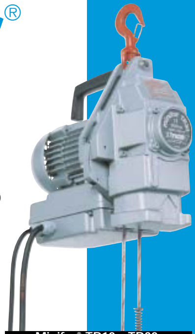
Minifor® TR10 - TR30 Rated Load 220 lbs - 660 lbs