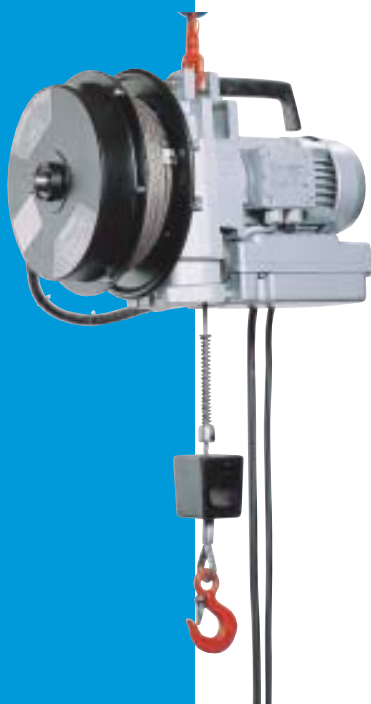
Minifor® fitted with wire rope reeler