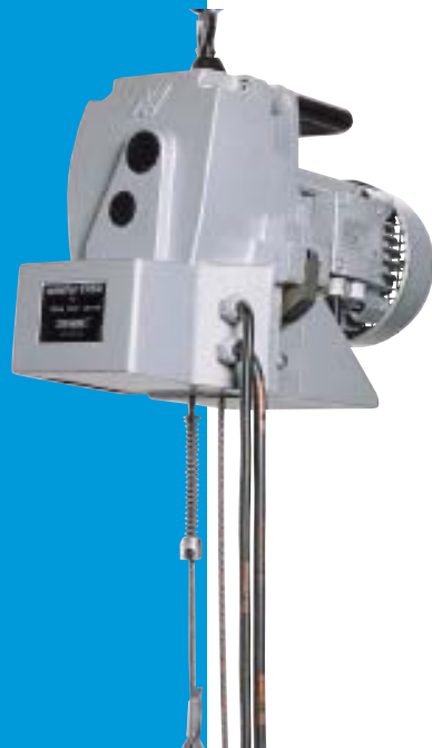
Minifor® TR30S - TR50 Rated Load 660 lbs - 1000 lbs