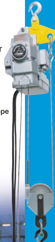
Minifor® TR10 - TR30 fitted with sheaving kit