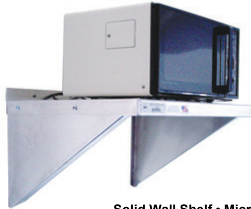
Solid Wall Shelf • Microwave