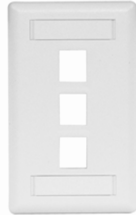
Plate Material High-impact thermoplastic (UL 94V-0)