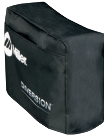
Protective Cover #300 579

#219 259 For power cable 5-20P (120 V/20 A). Optional, not included with machine.