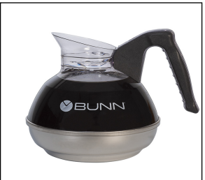
EASY POUR®, (BLK) 6/CS