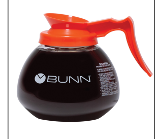
DECANTER, GLASS-ORN 12 CUP 1PK