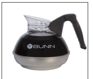
EASY POUR®,(BLK) 24/