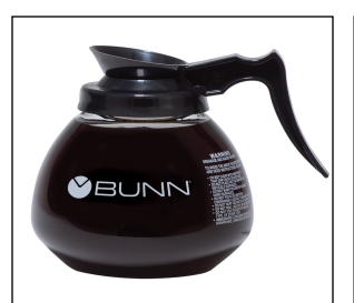
DECANTER,GLASS-BLK 12C 24/CS