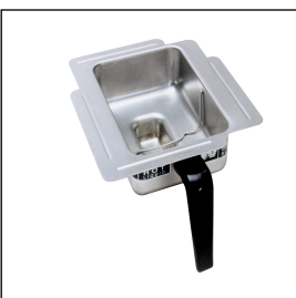
FUNNEL ASSY, SST-PP BLK HNDL