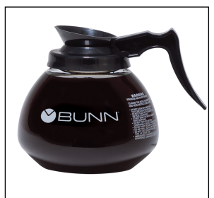
DECANTER,GLASS-BLK 12C 3/CS