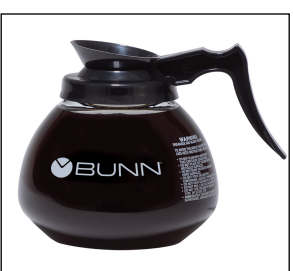
DECANTER,GLASS-BLK 12CUP 1PK