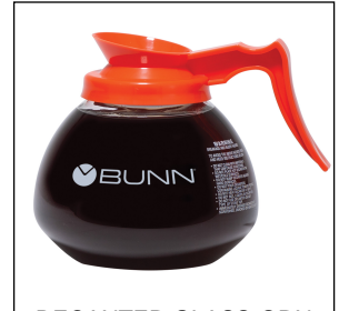
DECANTER,GLASS-ORN 12C 24/CS