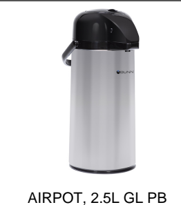
AIRPOT, 2.5L GL PB SINGLE PK