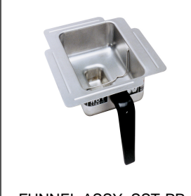
FUNNEL ASSY, SST-PP BLK HNDL