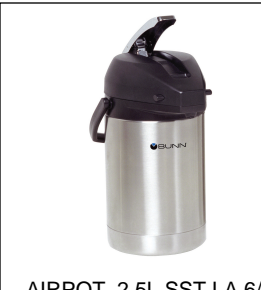
AIRPOT, 2.5L SST LA 6/ CASE