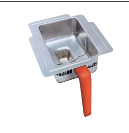
FUNNEL ASSY,SST-PP ORANGE HDL