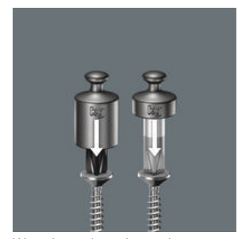
Wera Lasertip reduces the contact pressure required and enhances force transfer – meaning less screwdriving effort is required. Screwdriving becomes safer and easier.