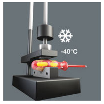
Impact strength tested at -40°C, guaranteeing safety even under extreme conditions.