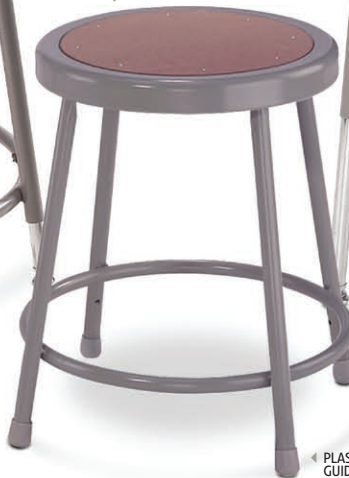
MODEL 6218 SHOWN