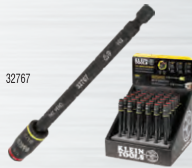
Counter Displays included