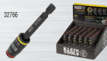
*32766 can be used with Klein 32308 Stubby Screwdriver