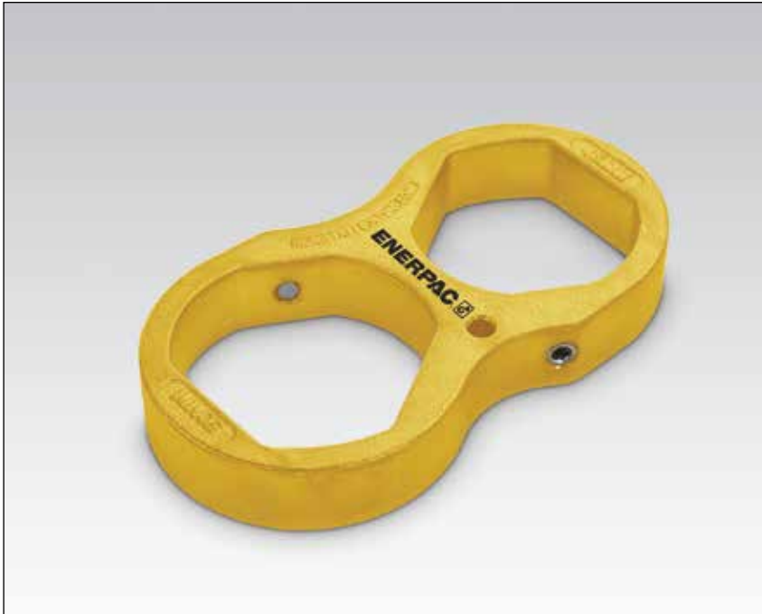
▼ BUS03 Back-Up Spanner (safety cable not shown)