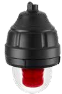
Shown with pendant mount