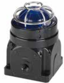
Ex d Surface Mount