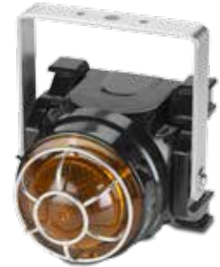
Ex d U-Bracket Mount*