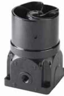
Ex d Surface Mount