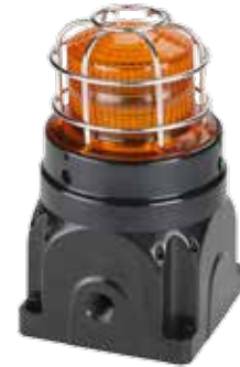
Ex d Surface Mount