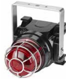
Ex d U-Bracket Mount*