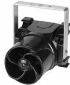
Ex d U-Bracket Mount*