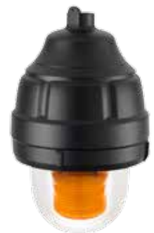
Shown with pendant mount