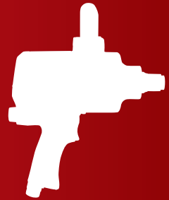
295A Impacttool™ 1" Drive