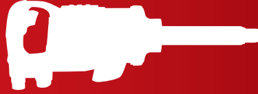
285B-S6 Impacttool™ #5 Spline drive includes extended 6" anvil