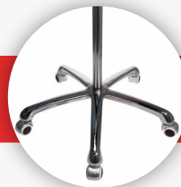
Easy-Roll Swivel Casters