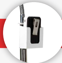
Attachable Battery-Pack Cradle