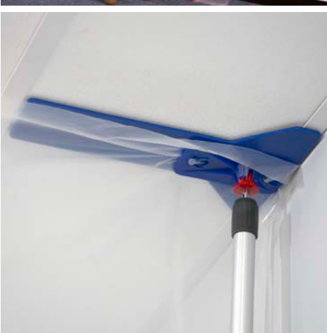
DUST BARRIER KITS