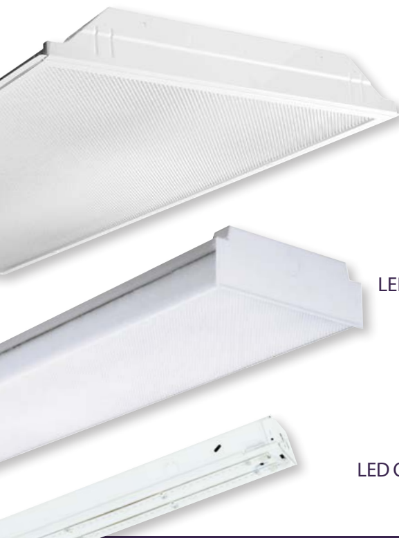
LJT LED Troffer