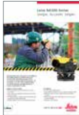
Leica NA300 Series Flyer

PROTECT is subject to Leica Geosystems' international manufacturer warranty and the general terms and conditions for PROTECT. For more information visit www.leica-geosystems.com/protect