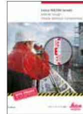
Leica NA700 Series Brochure