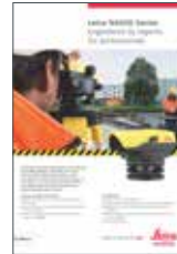
Leica NA500 Series Flyer