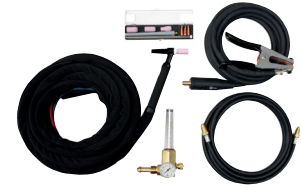
301268 kit shown.