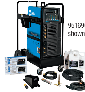
951695 package shown.