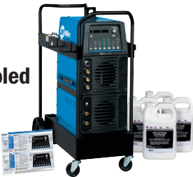
907717001 Dynasty 400 TIGRunner® shown with four bottles of 043810 low-conductivity coolant.

Select desired stock number for each step.