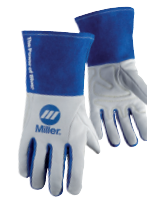
Performance TIG Gloves