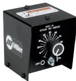
RHC-14 Hand Control 242211020

Maximum flexibility is accomplished with a reconfigurable cord that can exit the front, back or either side of the pedal. Foot pedal provides remote current and contactor control. Includes 20-foot (6 m) cord and 14-pin plug.