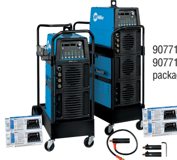
907717001 and 907719001 packages shown.