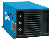
Coolmate™ 3.5 300245 Designed to integrate with the Dynasty and Maxstar 400 and 800

power sources. For use with water-cooled torches rated up to 600 amps. 3.5-gallon capacity.