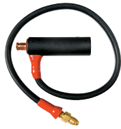
Water-Cooled TIG Torch Connector 225028 For Dynasty and Maxstar 800. 50 mm thread-lock with water return line. For use with all Weldcraft™ water-cooled torches.

Dinse-style with water return line. For use with all Weldcraft™ water-cooled torches.