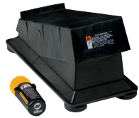
Wireless Remote Foot Control 300429

For remote current and contactor control. Receiver plugs directly into the 14-pin receptacle of Miller machine. 90-foot (27.4 m) operating range.