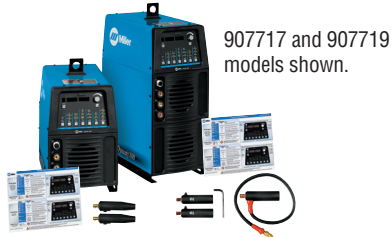
907717 and 907719 models shown.

Order machine only or use a single stock number to order a complete preconfigured system.