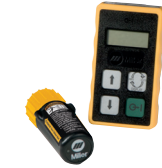
Wireless Remote Hand Control 300430

For remote current and contactor control. Receiver plugs directly into the 14-pin receptacle of Miller machine. 90-foot (27.4 m) operating range.