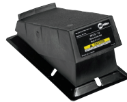
194744 remote shown.