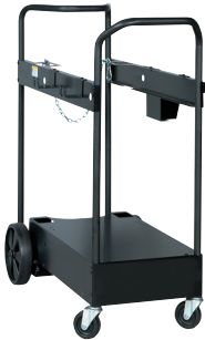
Runner™ Cart 300244 Designed to accommodate Dynasty or Maxstar 400 or 800 power sources and a Coolmate™ 3.5 cooler. Cart features single cylinder rack, foot pedal holder, three cable/torch holders, and two TIG electrode filler holders.