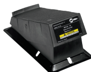
194744 remote shown.