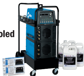
907717001 Dynasty 400 TIGRunner® shown with four bottles of 043810 low-conductivity coolant.

Select desired stock number for each step.