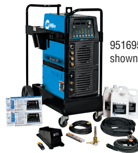
951695 package shown.