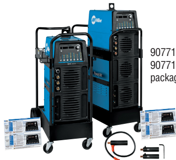
907717001 and 907719001 packages shown.