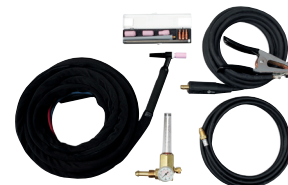
301268 kit shown.