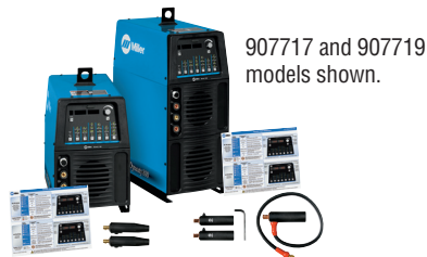
907717 and 907719 models shown.

Order machine only or use a single stock number to order a complete preconfigured system.