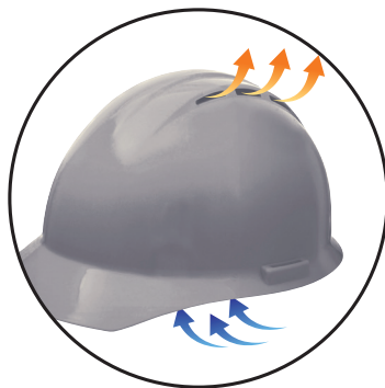
Natural Convection Airflow