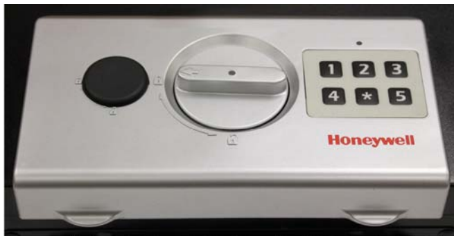
Programmable 1 to 6 Digit Electronic Digital Keypad Lock (4 AA Batteries Included)