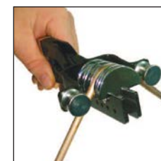
Create smooth bends in seconds for a professional look

1.800.390.3996 • phone: 330.745.3300 • fax: 330.745.3488 • www.surrauto.com