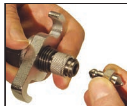
Quick Chuck for Fast Punch Changeover

All items included in kit, and are available for individual order.