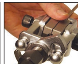
S-Lock for Quick Assembly