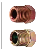
Create and Connect Extension Using: 3/16" BR145 & BR-EZ100 (sold separately) OR 1/4" BR1150 & BR-EZ200 (included in FA14 kit)