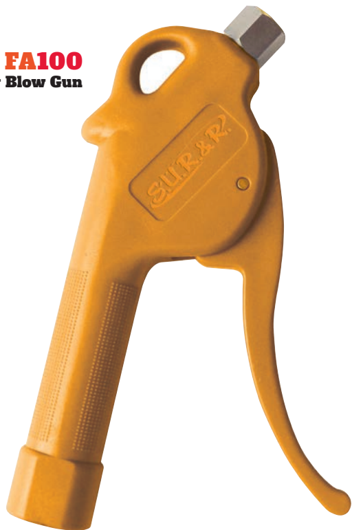
FA100 Flex Air Blow Gun