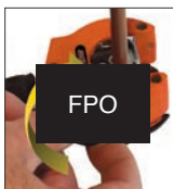
Cut tubing to desired length