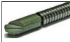
Heat-treated tip rips through carbon deposits