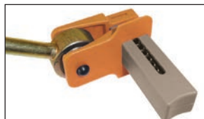
Use on banjo fittings up to 1/2"