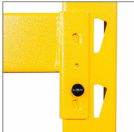
SHELF LOCK SAFETY PIN