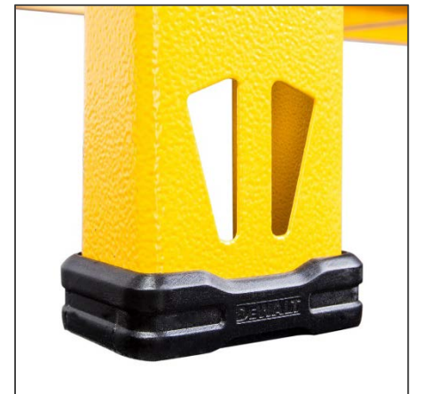
PROTECTIVE CAPPED FEET