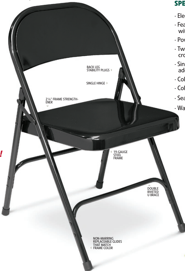
MODEL 510 SHOWN

products meet or exceed applicable ANSI/BIFMA standards