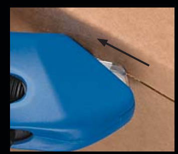
Continue your cut, letting friction of box maintain blade exposure. Blade guard will autiomatically relock at the end of the cut.

Blade-less Tape Splitting <u>eliminates</u> all cut injuries.