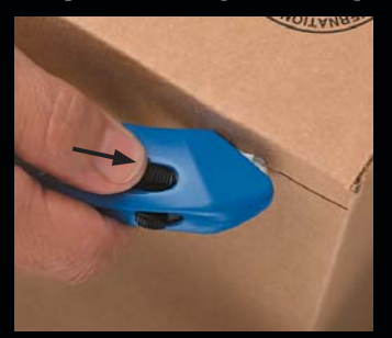
Push Release Button forward allowing guard to retract and expose the blade.