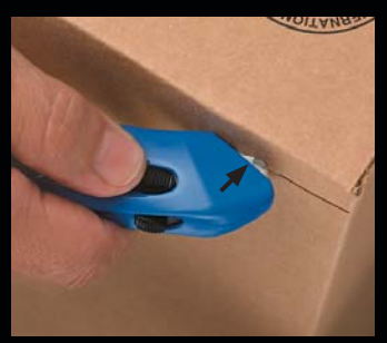
Press blade firmly into cutting surface to start the cut. Place opposite hand out of the path of a cut line.

Blade-less Tape Splitting <u>eliminates</u> all cut injuries.