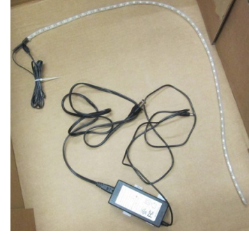
(1) F-SFLL-5M (1) F-SFLLPS-12V