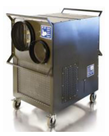
AIR COOL/HEAT/UVGI FILTRATION (1) F-EMAT3T