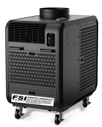
36,000 BTU 110V AIR CONDITIONER (1) F-CP36