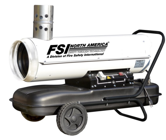
OIL INDIRECT FIRED 70,000 BTU AIR HEATER (1) F-HVFBV77