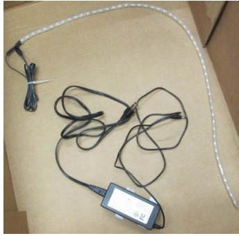
(1) F-SFLL-5M (1) F-SFLLPS-12V