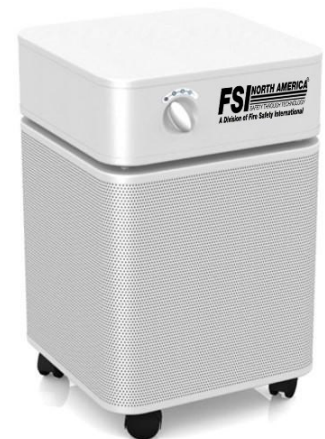
HEPA AIR CARBON FILTER UNIT (1) F-HAS