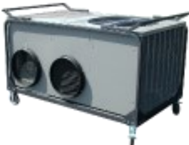
DUAL HEAT/COOL (1) F-DI25HP0105CM