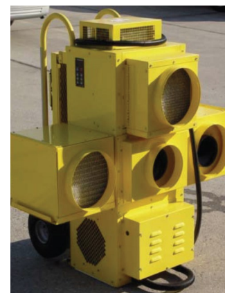
AIR COOL/HEAT/UVGI FILTRATION (1) F-HC-7400