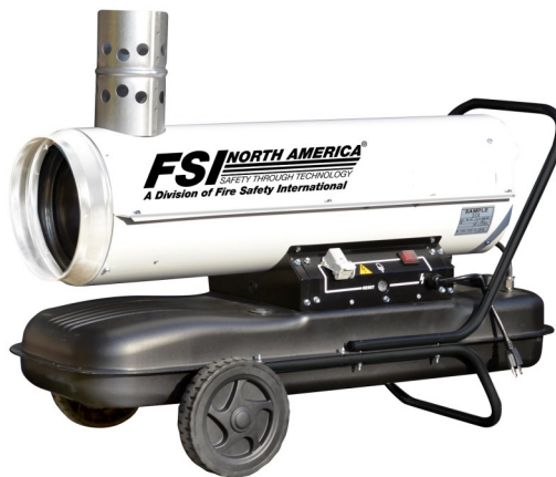
OIL INDIRECT FIRED 70,000 BTU AIR HEATER (1) F-HVFBV77