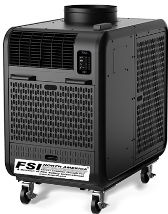
36,000 BTU 110V AIR CONDITIONER (1) F-CP36