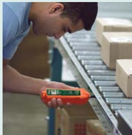
Accessory wheels enable tachometer to measure linear surface speeds