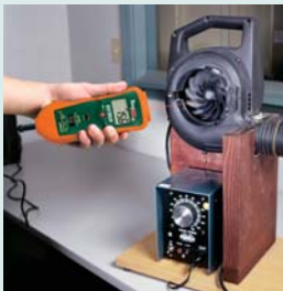
Non-contact model for use on machinery where high speed measurements are required