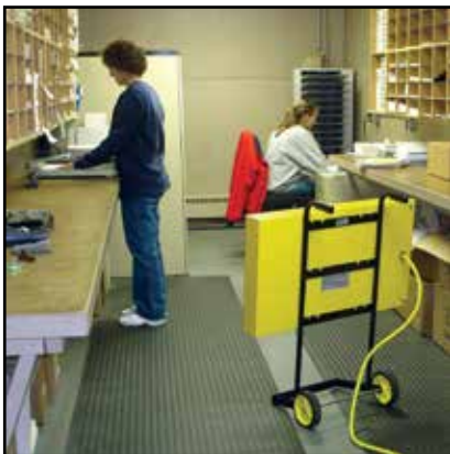
120-240 Volt Application