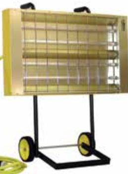
CH-6424-1C plug NEMA L6-30 twist lock

Intertek ETL Listed for Overhead Operation Only