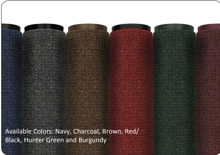
Available Colors: Navy, Charcoal, Brown, Red/Black, Hunter Green and Burgundy