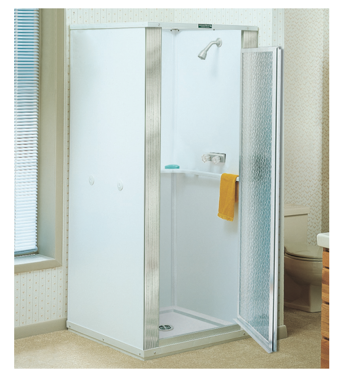
Model 80 shown with optional shower door.

Two Popular Sizes: 32" x 32" and 36" x 36"