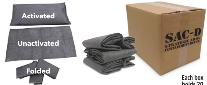
Each box holds 20

Box: 12" x 9" x 9" Weight 14 lbs Qty/Pallet 144 Cases 2,880 SAC-Ds /Pallet