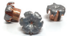
.40 Caliber Rounds stopped in SAC-D from 10 Yards