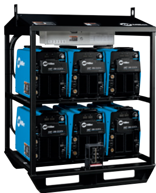
XMT 350 6-pack shown.