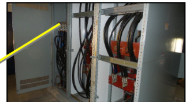
SWGR 96-SWG-01 Cabinet A, B, C