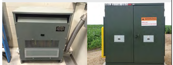
Custom replacement dry transformer panel-front with a built in maintenance inspection window