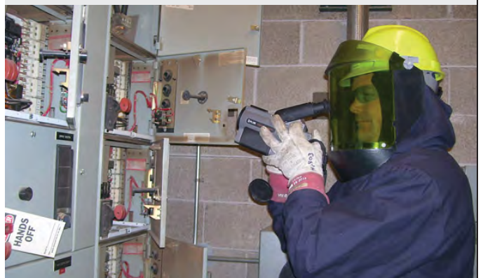
Infrared scanning is applicable on all electrical assets including motor control centers, but typically requires extensive PPE if done “open panel”