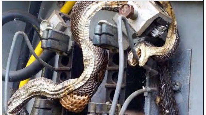
Pests and their predators can be attracted to warm, dry spaces inside transformers