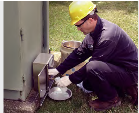
A safer oil sampling method retrofitted to an existing transformer allows energized sample collection; the sampling cabinet is lockable to prevent unauthorized access