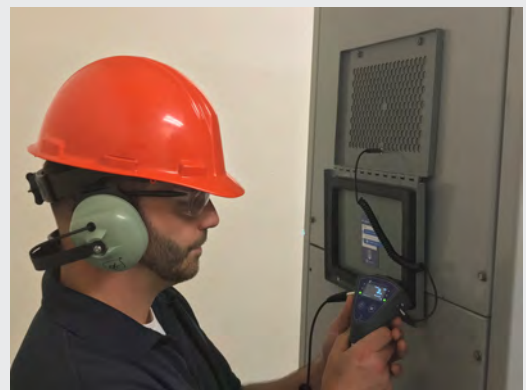
With a maintenance inspection window for visual, infrared, ultraviolet, and ultrasound inspections installed on medium voltage switchgear, no special PPE is required to use the EMSD