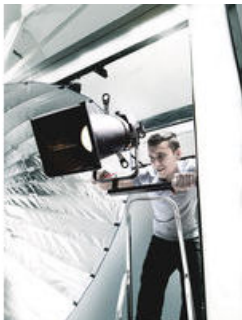
L-key for TORX® socket screws with safety pin