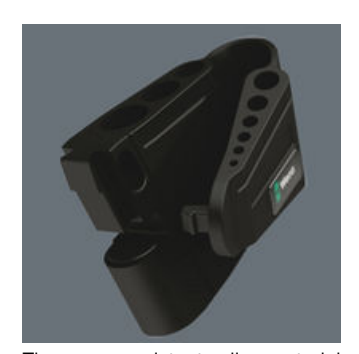
The wear-resistant clip material ensures that the L-keys are securely held yet are easy to remove.

Take it easy tool finder system—with profile and size colour-coding for quick and easy tool selection. Colour-coded system for hexagon drive screws (L-Keys, Zyklop bit sockets), external hex drive screws and nuts (Joker wrenches, Zyklop sockets and Zyklop bit sockets with holding function), and TORX® drive screws (L-Keys, Zyklop bit sockets).