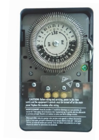
8009A 24 Hour Duty Cycle Time Switch