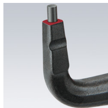
Sturdy, inserted tips: made from high-density spring steel