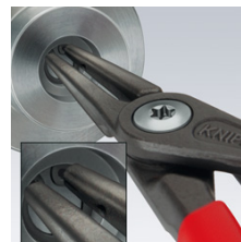
Slim head shape