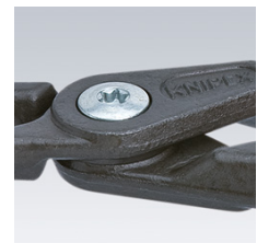
Bolted joint: high precision and smooth action