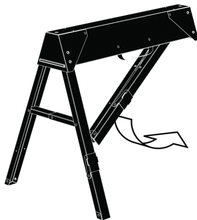
4 FOLD OUT THE 2 ND SET OF LEGS