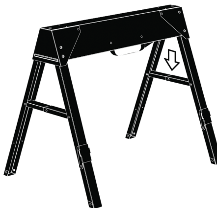
5 STRAIGHTEN THE CROSS BRACE