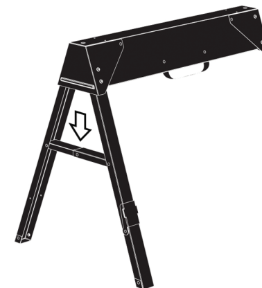
3 STRAIGHTEN THE CROSS BRACE