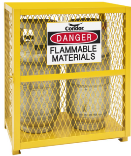
491M93 Holds 2 gas cylinders