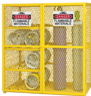
491M92 Holds 9 vertical & 8 horizontal gas cylinders