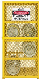
491M90 Holds 8 gas cylinders