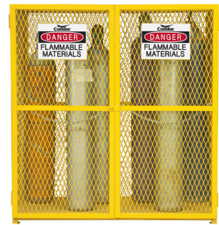
491M96 Holds 18 gas cylinders