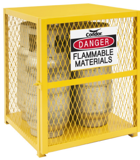
491M79 Holds 4 gas cylinders