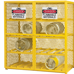
491M91 Holds 16 gas cylinders