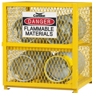
491M88 Holds 4 gas cylinders