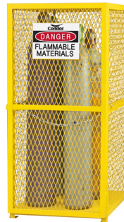
491M95 Holds 9 gas cylinders