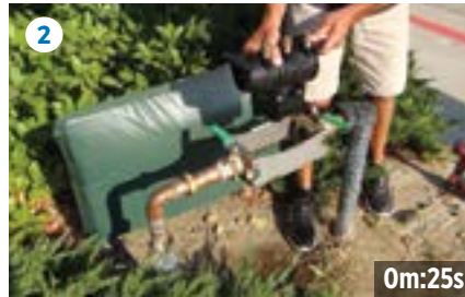
Un-bolt or un-screw and remove EZSwap Pressure Vessel.