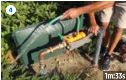
Attach hose to Flush Fitting Tool and turn on inlet ball valve. Direct water to landscaping or safe drain and flush until clear.