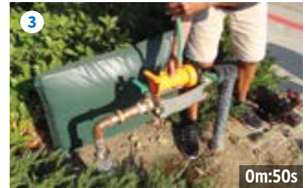
Drop in and install Flush Fitting Tool.