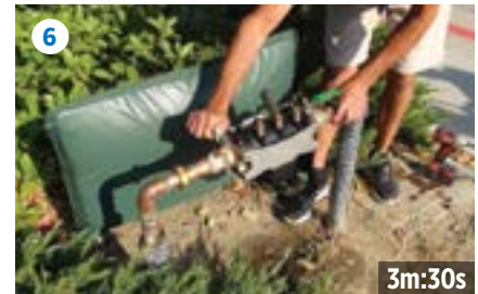
Commission the backflow and start up system.