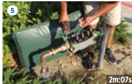
Remove Flush Fitting Tool and reinstall EZSwap Pressure Vessel.