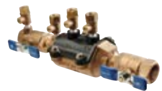
3/4" 350 Double Check Valve Assembly